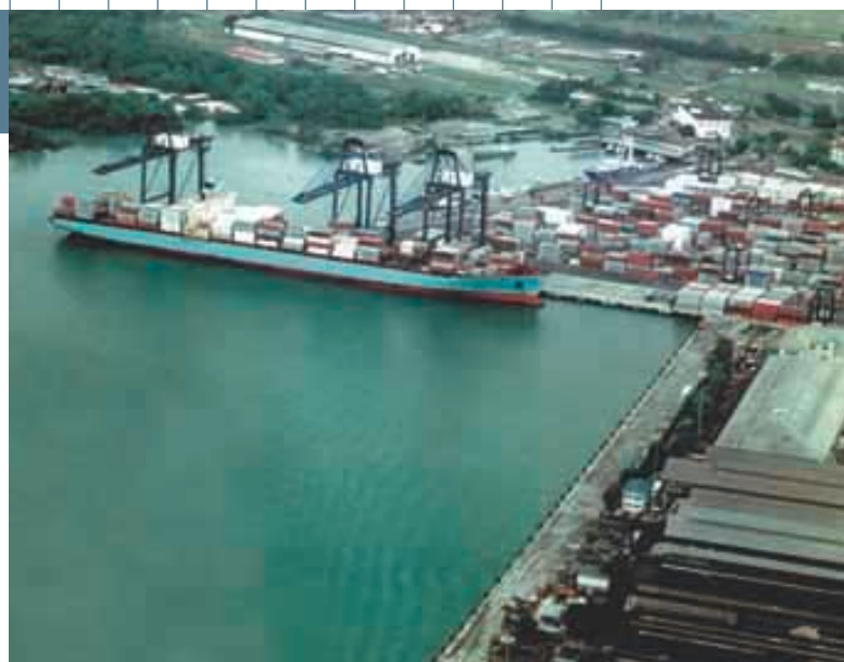
The Port of Balboa serves the trans-Pacific trades.