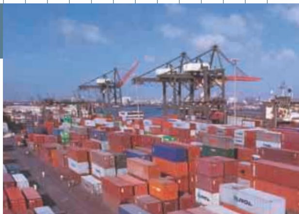
KICT is located at the Port of Karachi, a natural deep-water harbour on the Arabian Sea.

In May, the Group, together with two local partners, acquired the rights to develop and operate the seven berth Phase II terminal of Kwangyang port in South Korea and construction work is progressing well. The first three berths, with a capacity of 1.0 million TEUs, are expected to be operational in the second quarter of 2002 and the entire facility is scheduled to be fully operational in 2004. Currently the Group has an 80% interest in this container terminal facility. The two partners have call options which expire at the end of 2004, and if exercised, would reduce the Group's interest to 40%. The Group further expanded its presence in South Korea in February this year with the acquisition of three operating terminals, two in Pusan and one in Kwangyang. These three terminals have a combined capacity of 3.0 million TEUs.